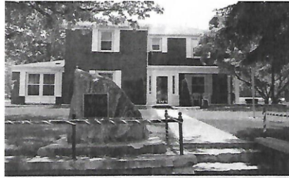
Ohio House – Built in 1935 and maintained by VFW Dept. of Ohio and Ladies Auxiliary – contains 2,874 sq.ft., 4 bedrooms, 2½ bathrooms.