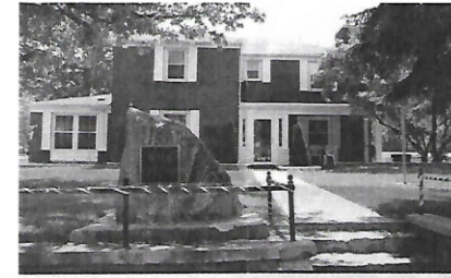
Ohio House – Built in 1935 and maintained by VFW Dept. of Ohio and Ladies Auxiliary – contains 2,874 sq. ft., 4 bedrooms, 2 1/2 bathrooms.